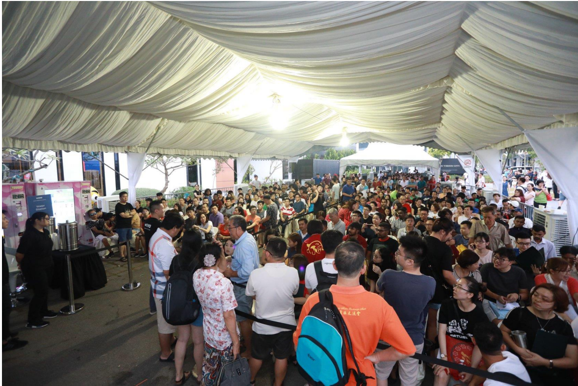
Some of the aspiring buyers queued a day before their allocated selection date, to secure their preferred unit.