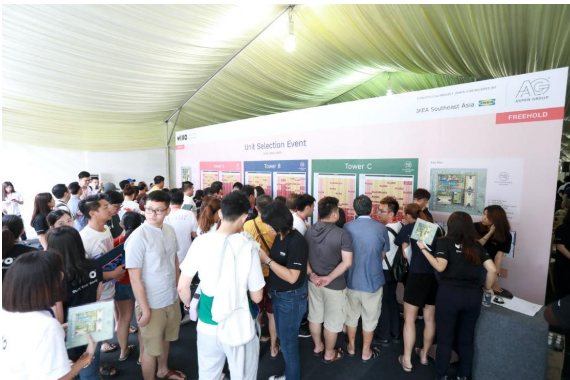
More than 1300 units were booked in just 2 days.